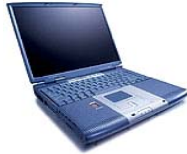
Biometric Access laptop TransPort GX3